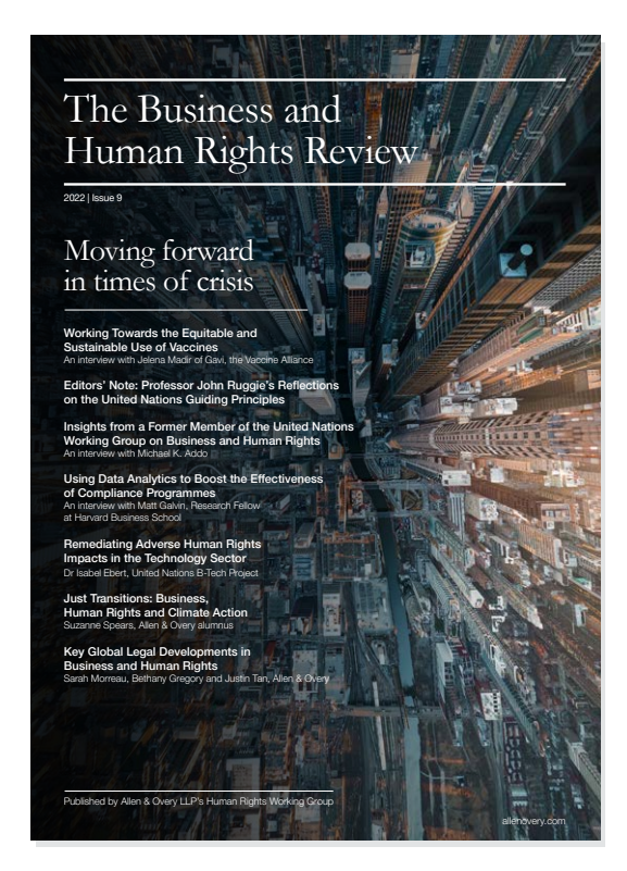
Winter 2022 | Issue 9