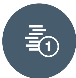
BANKING & FINANCE

Known for our international expertise and detailed knowledge of the local legal and business environment, we act for a wide range of Slovak and multinational clients and play a leading role in complex transactions. Our reputation in the country is built on the blend of global and local knowledge we offer, combined with high quality services and commitment.