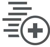
Follow on investments