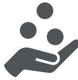
Interim dividends and other equity distributions